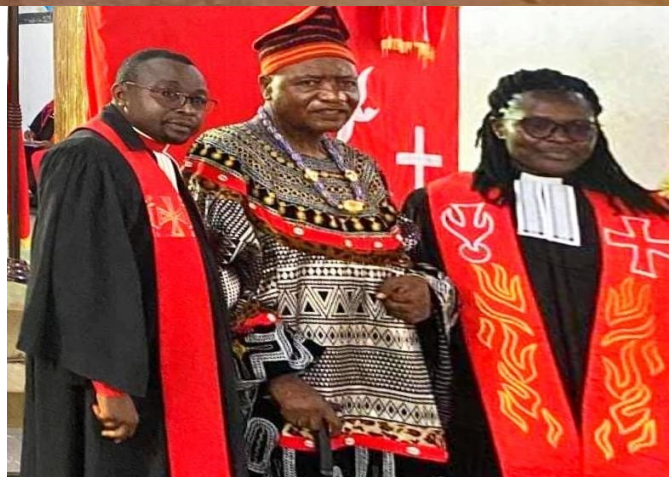
College of Pastors and spouses of the Presbytery ,friends and well wishers.